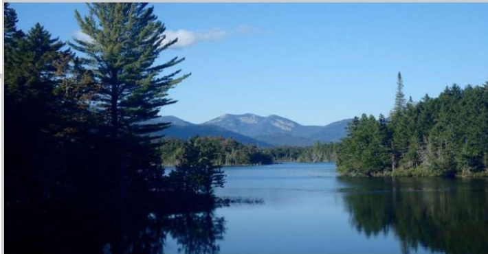
View of Gothic Peaks at Boreas Ponds in the Adirondacks

An Albany judge has upheld the state's construction of new snowmobile trails in the Adirondacks, which had been opposed by an environmental group.