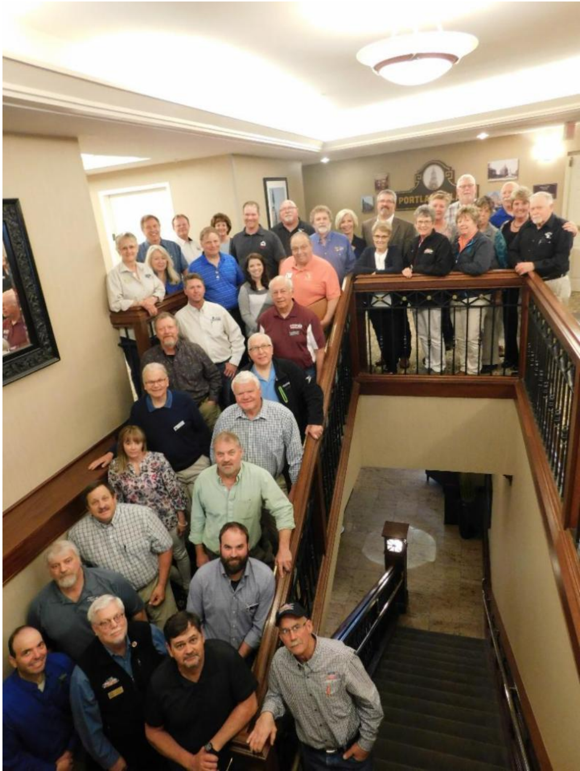
In addition to business meetings, the snowmobilers had a whole day of